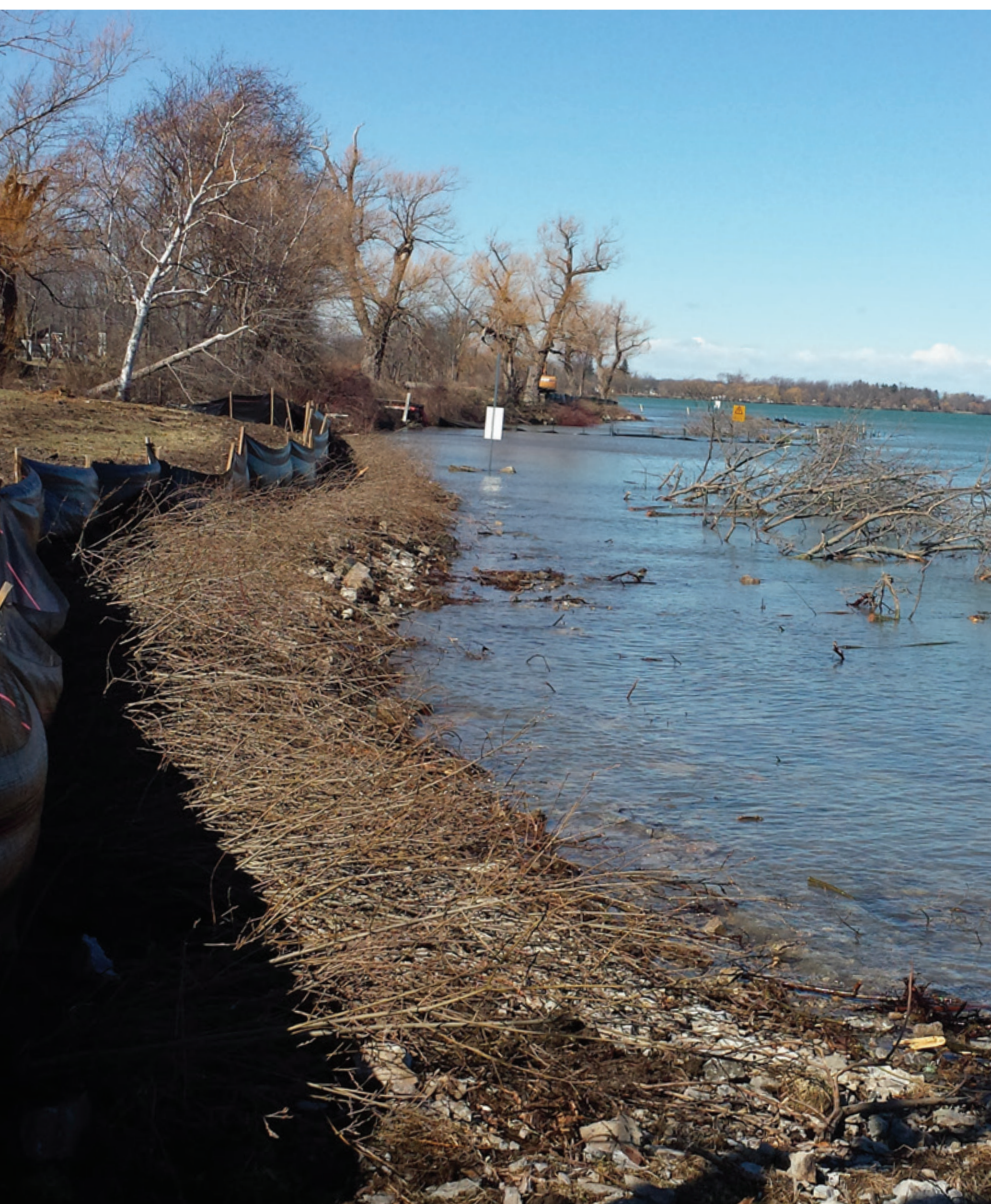
Completed coastal wetland